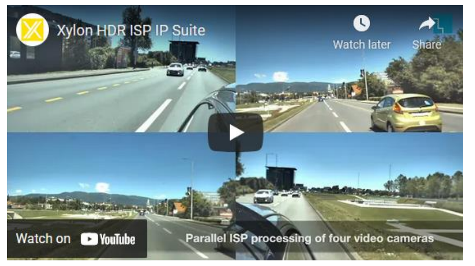
Figure 6: Presentation of the Xylon logicBRICKS HDR ISP Evaluation kit

The following logiHDR IP core blocks support multiple channel processing: Dynamic Range Compression and Brightness Enhancement.