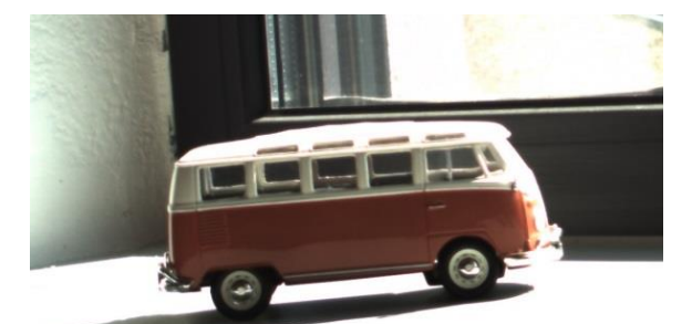
Figure 2: Camera Video Input, Short Exposure Figure 3: Camera Video Input, Long Exposure