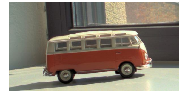
Figure 4: HDR Processed Video Input from Camera